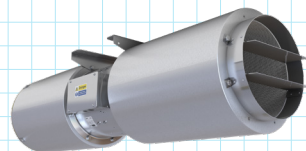
Smoke Exhaust Fan