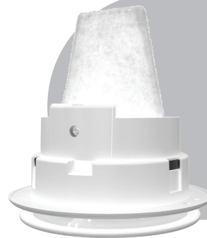
Q-AIRE-EV125F Extract Valve with filter