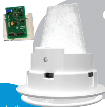
Q-AIRE-EV125FH Extract Valve with filter and fitted integral humidistat

This in-built humidity sensor simply uses the Ecosmart SELV cable to connect back to the MVHR or MEV unit.